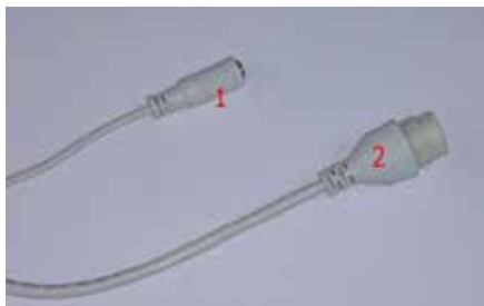
1-Power Supply 2-network interface